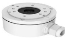
DS-1280ZJ-XS Junction Box